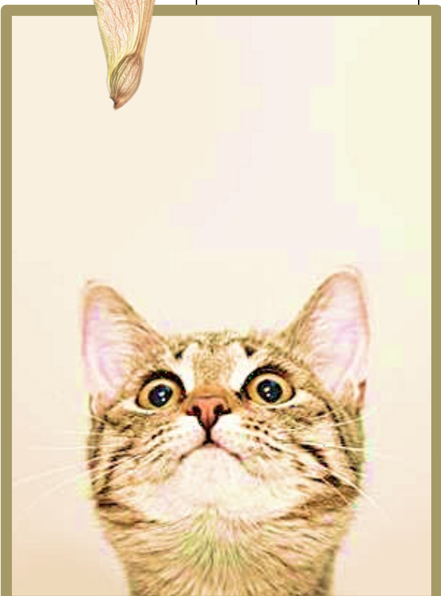
Figure it out!